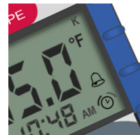
Count-down timer and alarms