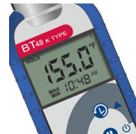
Max/Min feature recalls highest and lowest reading